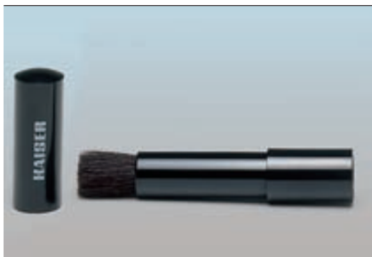
6301 Lens Brush

Round brush with silicone blower bulb. Can be set upright. Length: approx. 10 cm (3.9 in.) Bellows diameter: approx. 5/3.3 cm (2/1.3 in.)