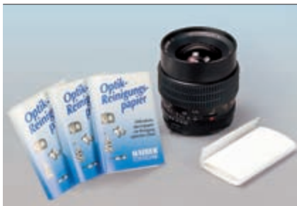
6695 Optical-Glass Cleaning Paper

In plastic tube. With lipstick twist mechanism, not lubricated. Length (extended): approx. 10.5 cm (4.1 in.) Tube: approx. 8 cm (3.1 in.)