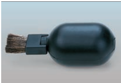
6314 Blower Brush

Flat brush with large rubber blower bulb. Length: approx. 11 cm (4.3 in.) Bellows diameter: approx. 4 cm (1.6 in.)